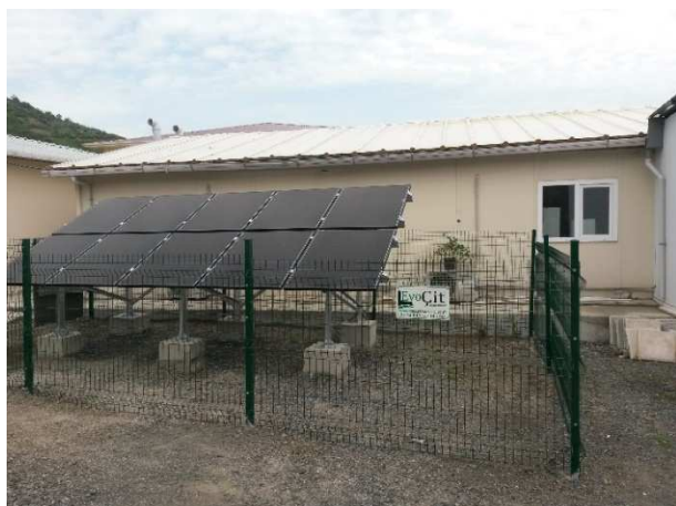
Figure 2. Base construction for ground-mounted systems

Each array is also protected by a fuse and a blocking diode. The peak DC output of 5 PV panels is 595V, output current 3.14A, and rated output power is 1.7kW. Fuses and the blocking diodes for each panel are located in a DC collection box. The installed PV system is shown in Figure 2.