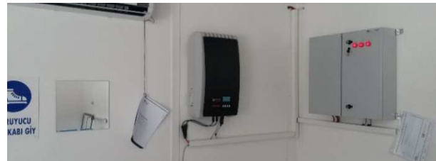
Figure 1. Donated PV Panels Solar Frontier 170 Watt, SF 170-S) and Inverter (Solar Frontier SF-WR-3203) (at the left side is inverter, at the right side is the dc/ac collection network)

The PV system will feed into a number of different existing buildings on the campus. The project has significant LEED aspirations, which indicated that a large array size would be preferred; however, challenges with utility interconnection and existing building electrical equipment required significant review to determine optimal system sizes. The average size of our project to date is approximately 1.7kW, with 10 PV panels. Our example power plant consists of an outdoor installation of PV panels, a dc collection network, an indoor installation of inverters, and high-voltage ac switchgear to connect to the electric utility grid. Nominal Power (3200W) of SF-WR-3203 inverter was used in this project. In Turkey, the frequency limits are between 47.50Hz and 50.20Hz, minimum input voltage for grid-feeding is 250V and rated input voltage is 410V. Power losses of inverter in nighttime operation is less than 3W and maximum efficiency is about 98.6%. Own consumption of the inverter is less than 8W and includes 1x RJ45 socket (Ethernet for TCP/IP network) for communication, e. g. with a central data server. The data in the plot comes from the SF-WR-3203 in June, 2016 where the inverter temperature is about between 45-50°C. However, as shown in Fig. 1, the inverter is in "energy laboratory" under the roof and the temperature differences between winter and summer are not as drastic as they would be for inverters located outside.